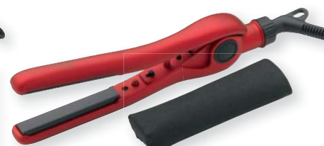
MH3001 THE HOTTIE STRAIGHTENING IRON