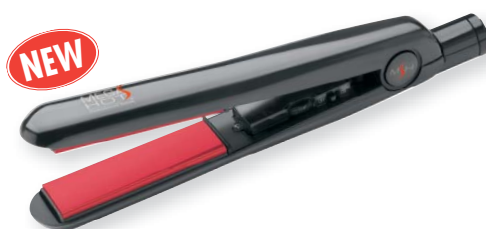
MH3004 1" CERAMIC STYLING IRON