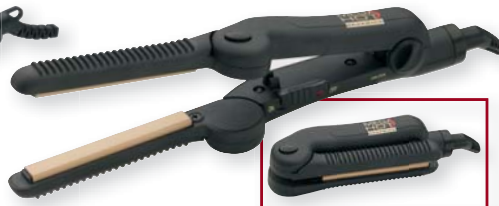
MH1020 TRAVEL FOLDING IRON