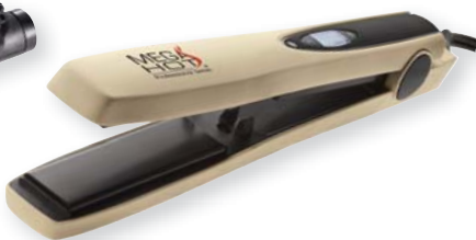
MH2057 DIGITAL SLIM STRAIGHTENING IRON with Tourmaline