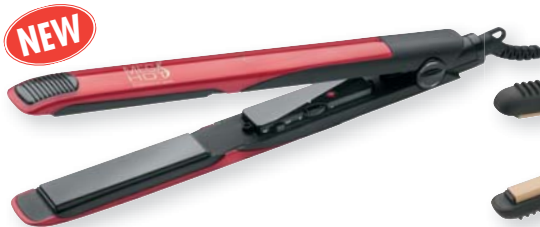
MH3003 1" PROFESSIONAL SLIM CERAMIC STRAIGHTENING IRON