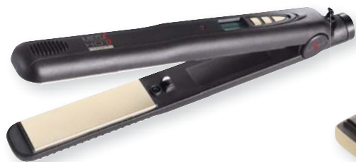
MH2024 PROFESSIONAL 1" ACCUSILVER™ LCD STRAIGHTENING IRON with Tourmaline