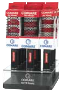
CBT8 11-PC. DISPLAY