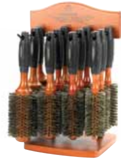
C333111 12-PC. DISPLAY