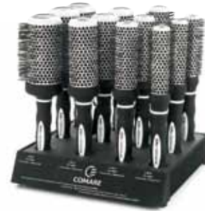
CBT1 12-PC. DISPLAY