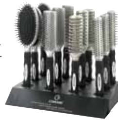
CB614 12-PC. DISPLAY