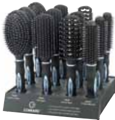
CB604 12-PC. DISPLAY