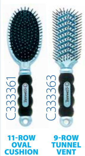
C333361 11-ROW OVAL CUSHION C333363 9-ROW TUNNEL VENT