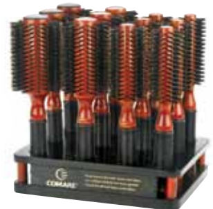
CB634 12-PC. DISPLAY