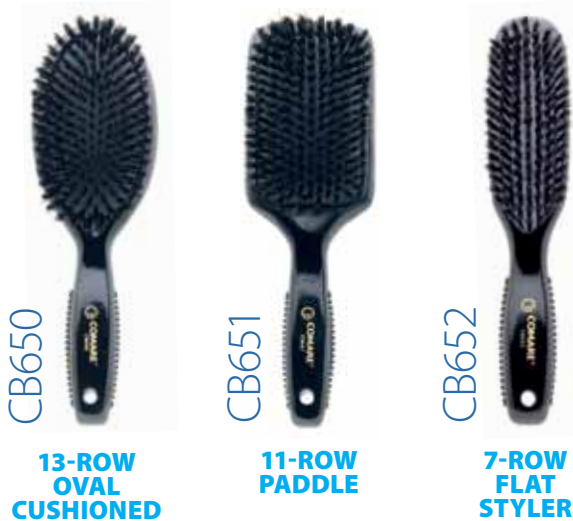
CB650 13-ROW OVAL CUSHIONED CB651 11-ROW PADDLE CB652 7-ROW FLAT STYLER

Boar bristles cleanse hair while helping to distribute natural oils, creating shine and eliminating flyaway hair.