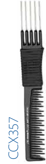
MARK V® COMB ANTI-STATIC W/ BACTI-BAN™