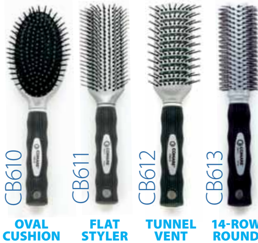
CB610 OVAL CUSHION CB611 FLAT STYLER CB612 TUNNEL VENT CB613 14-ROW ROUND