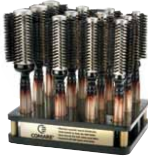
CB644 12-PC. DISPLAY