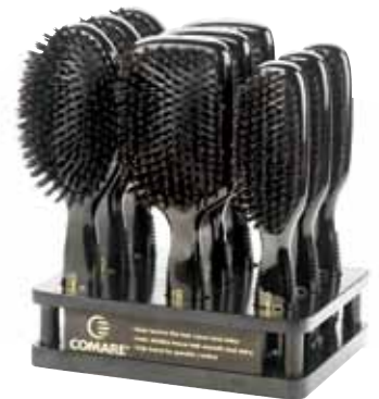
CB653 9-PC. DISPLAY