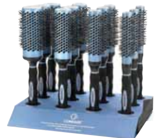
CB624 12-PC. DISPLAY