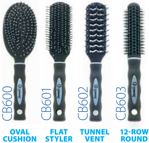
CB600 OVAL CUSHION CB601 FLAT STYLER CB602 TUNNEL VENT CB603 12-ROW ROUND